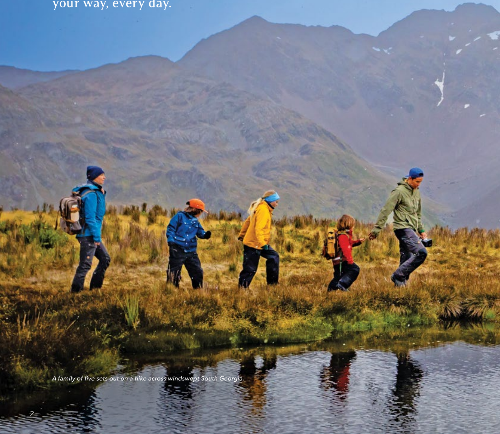
A family of five sets out on a hike across windswept South Georgia.

Hiking, kayaking, and snorkeling: on a Lindblad Expeditions-National Geographic voyage, these activities are more than just simple excursions. They are the essential elements of exploration, working together to give our guests an in-depth experience. No matter which of our activities you choose, you get a more complete picture of your destination—and each can be customized to your interests so you can explore your way, every day.